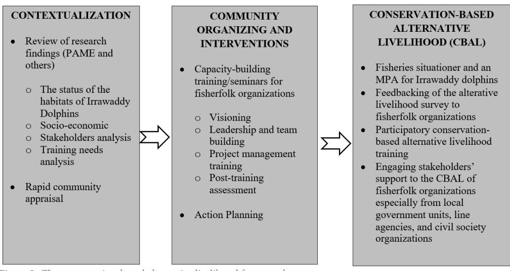
Figure 2. The conservation-based alternative livelihood framework