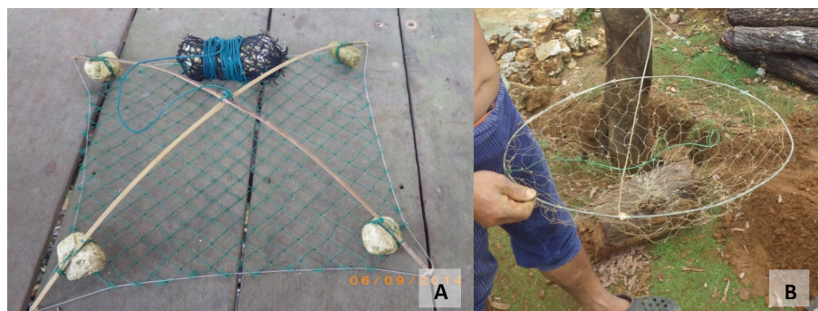
Figure 3. Types of crab lift nets: (A) the traditional crab lift net made of bamboo slats, polyamide netting, and frame; and (B) the modified crab lift net made of tie wire, nylon netting, and polyethylene rope

Commonly used baits are trash fish and bivalves such as slipmouth, green mussels ( tahong ) and brown mussels ( piyong ). Crab pots are usually deployed in waters 8-20 m deep. Setting operation varies according to location, water depth, and the number of pots used. Soaking time usually lasts from 10-12 hrs depending on the season. The crabbers usually deploy their pots at around 5:00 p.m. and haul them at around 4:00 to 5:00 a.m. the following day. Some crabbers in Catbalogan do multiple harvests within a day by alternately setting and hauling their pots. However, they have to own at least two sets of 30-70 pots to do so.