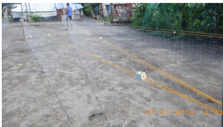
Figure 4. A crabber fixing a bottom set gill net in San Jose, Tacloban City

Crabbers using crab lift nets usually use non-motorized boats. The gear is also easy and cheap to maintain compared to the pots. Some of the crabbers in the region prefer lift nets over pots because the gears are cheaper, lighter, easy to construct, more easily stacked on deck, and occupy less space as observed