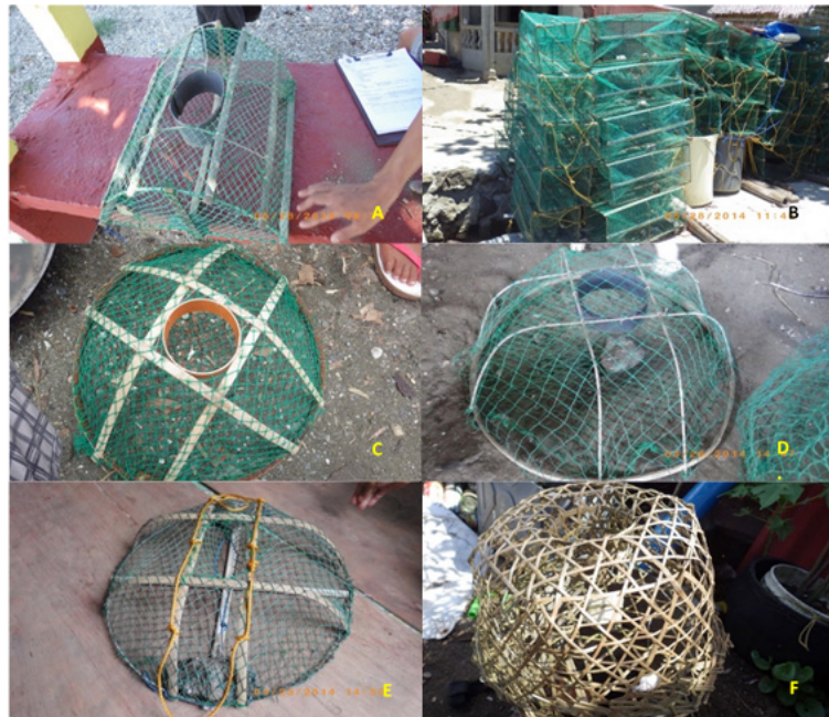
Figure 2. Different shapes and sizes of crab pots found from the different crabbing municipalities in the region: (A) Bombom, Catbalogan; (B) Yangta, Daram; (C) San Antonio, Basey; (D) Pangdan, Catbalogan; (E) San Jose, Tacloban; and (F) Naungan, Ormoc

The crab pot, locally known as panggal or timing , is a hand-crafted gear made of bamboo strips or tie wire and multifilament polyethylene netting with mesh sizes between 2.2-2.5 cm. The net is wrapped around a bamboo framework to form a dome-shaped trap (Armada 1996). Other designs of crab pot do not use mesh nets, rather the trap is made